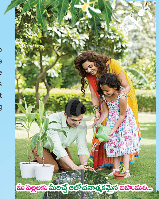
మీ పిల్లలకు మీరిచ్చే ఆలోచనాత్మకమైన బహుమతి...

తక్కువ పెట్టుబడితో... అత్యధిక రాబడి... మలబారు వేప ప్లాంటేషన్